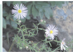
New York Aster flowers

Similar species: New York Aster ( Symphotrichum novi-belgii ) has wider flower heads with pale violet petals (rays) and is generally taller with longer leaves. New York Aster plants in southwest NS look different than the pictures in plant guides and have narrower leaves. Calico Aster ( Symphotrichum lateriflorum ) is infrequent on lakeshores (though common in disturbed areas like cottage lawns near lakeshores). It has similar small, white flower heads but tends to have main branches starting low on the plant and densely hairy midveins on the leaf undersides.