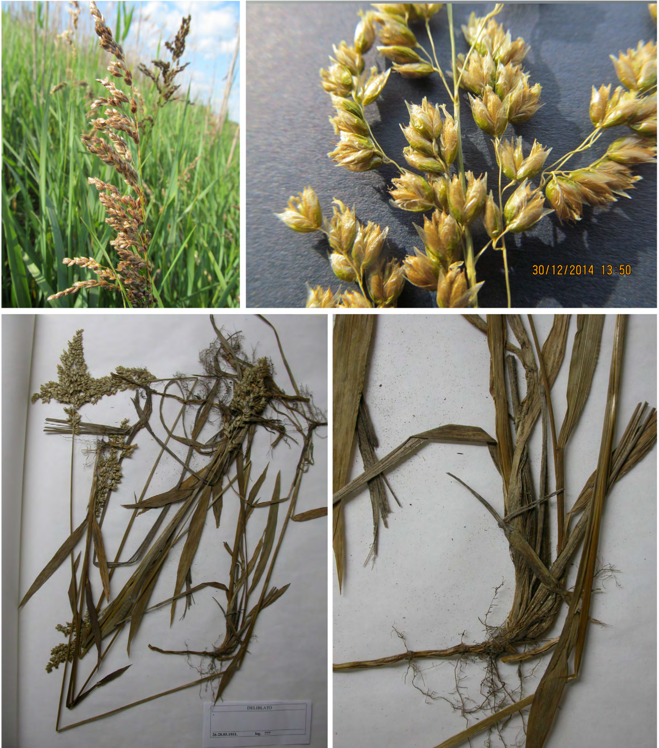
Figure 2. Upper left and right: individuals of Hierochloë repens (Host) Simonk. from Gospodinci; bottom left and right: old specimens of Hierochloë repens (Host) Simonk. from the Deliblato Sands (BEOU).