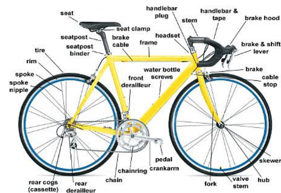
Figure 4: Anatomy of a Road Bike

Bike anatomy changes slightly depending on the style of bike, but the key components of a bike, tricycle or recumbent remain basically the same. This means that recycle methods can remain constant with bike variations (A Short Course In Bicycle Anatomy, 2020).