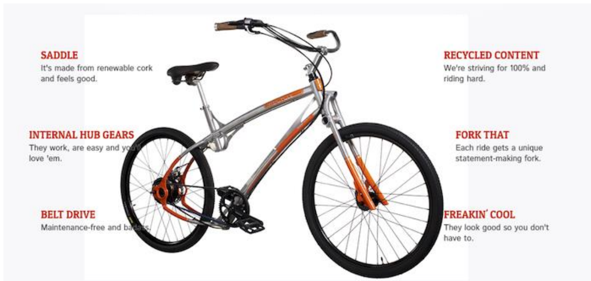
Figure 3: ReCycle Bike (The ReCycle Cycles, 2021)

Currently disposing of a helmet in an environmentally responsible way is not easy, as most helmets contain plastic shell, EPS foam liner, nylon or polyethelene straps and a plastic buckle (Bicycle Helmet Safety Institute, 2020). EcoHelmet is a folding, recyclable, vendable helmet, designed for bike share systems. It is made of waterproofed paper in a unique radial honeycomb pattern, gives bike share users a helmet that can be purchased with the bike rental and recycled after the ride (The James Dyson Foundation, 2021).