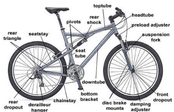
Figure 5: Anatomy of a mountain bike

Developing a bike frame that brings both scope in manufacturability and sustainability is a part of creating a circular industry, that overcomes our current waste problems. With innovations it is possible to redefine bike products we don't think could be modified, even though bikes with their simple functionality, can be assumed to be at its full potential.