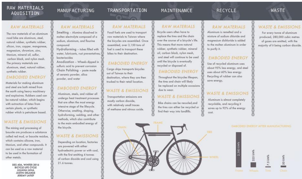
Figure 2: Bike Life Cycle (Juliana Luna, 2016)