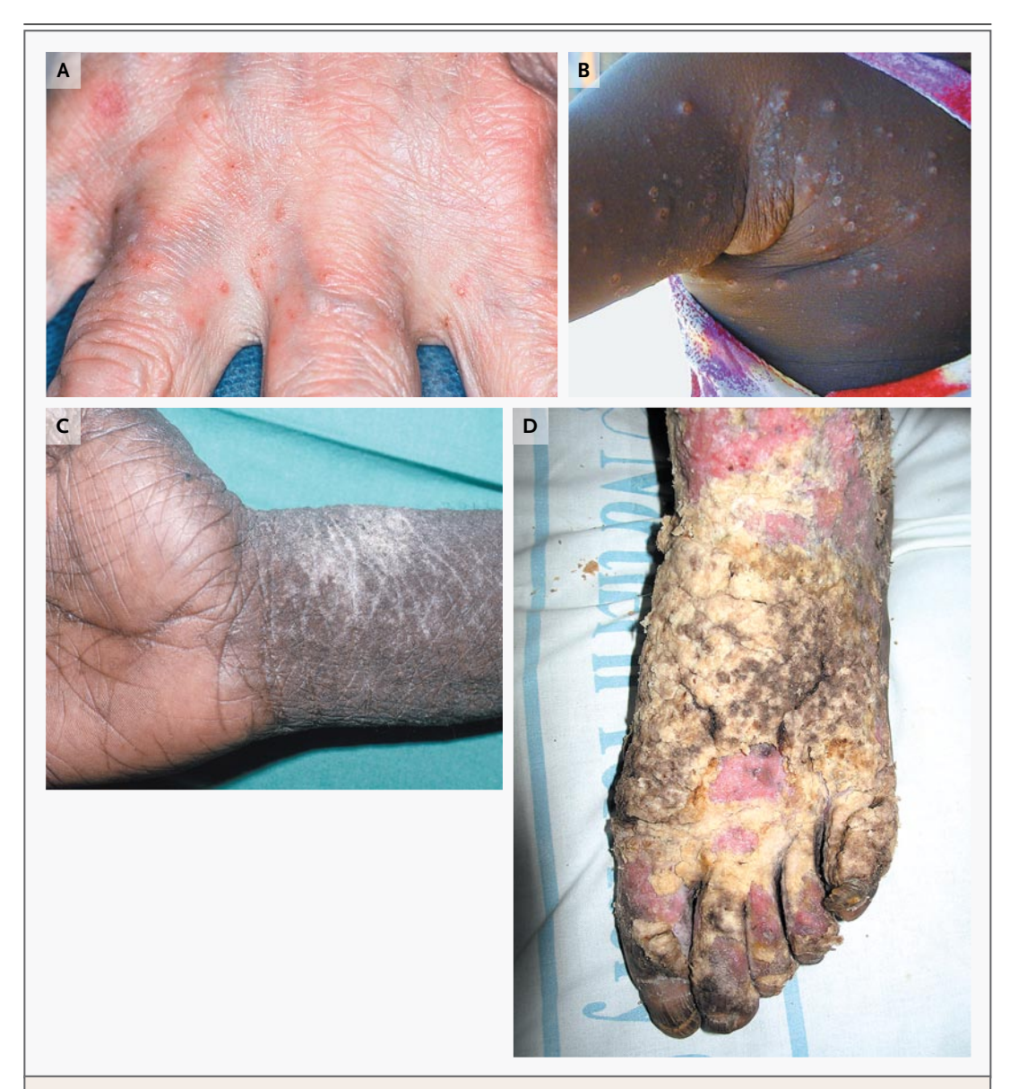
Figure 2. Manifestations of Scabies.

Interdigital lesions are a typical manifestation of classic scabies (Panel A). A pattern of excoriated pustules in the axilla is characteristic of scabies with secondary bacterial infection (Panel B). Crusted scabies can be manifested as excoriated, lichenified skin on the wrists and hands (Panel C). A case of severe crusted scabies can result in sloughing of layers of thick, hyperkeratotic skin, with fissures that can result in secondary bacterial infection and the potential for bacteremia and systemic sepsis (Panel D). Panel A reprinted from Chosidow.<sup>2</sup>