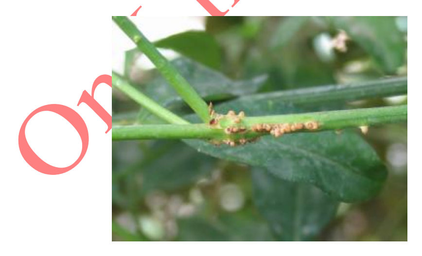
Fig. 2. Small gall on the stem of winter jasmine plant (Jasminum nudiflorum) inoculated with Pseudomonas savastanoi isolates

Four months after inoculation, the symptoms began to appear as a small gall around the site of inoculation only on the stem of winter jasmine (Fig. 2). The bacterium was reisolated from the galls of artificially infected plants. None of the inoculated olive, oleander, ash and privet plants with the isolates produced gall on their shoots. None of the control plants inoculated with sterile distilled water developed gall symptoms. P. savastanoi pv. nerii from Tehran produced galls on the stem of oleander. The reference strains of P. s. pv. savastanoi caused similar symptoms on the stem of winter jasmine.