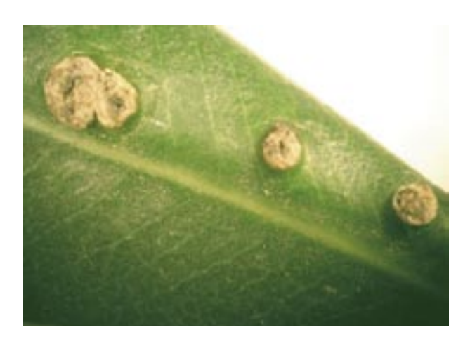
Figure 1. Parenchymatous knots on leaf surface of oleander. Natural infection

Twelf of the oxidase-negative strains from oleander were classified using the Biolog Identification System. The results presented in Table 1 show that five strains were Pseudomonas syringae pv. nerii ,