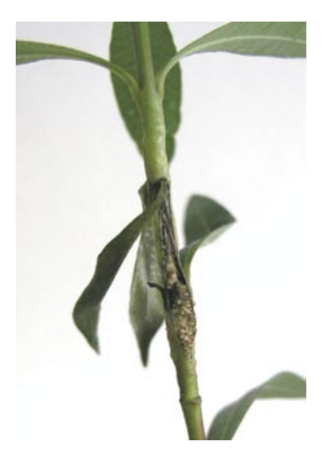
Figure 3. Primary and secondary parenchymatous knots following inoculation with Pseudomonas syringae pv. nerii on olender shoot

How might pv. nerii have been introduced to the Czech Republic, and are these strains a threat to ash? Knowing the history of the oleander plants on which pv. nerii was found in the Czech Republic, it seems probably that the pathogen was introduced on firm shoots that had been cut from an asymptomatic plant grown in the Mediterranean region. This kind of transmission is not surprising because the related bacterium Pseudomonas savastanoi pv.