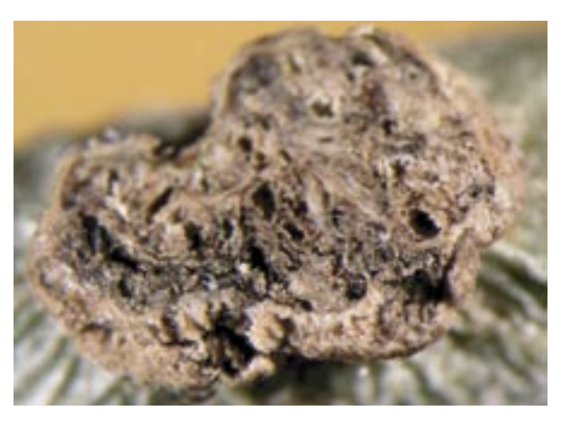
Figure 2. Cross section of parenchymatous knot showing lysogenous cavities with bacterial slime