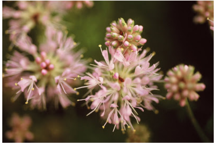
Feay's Prairie Clover: Dalea feayi

Hawthorn Hill Native Wildflower and Plant Nursery in Largo is a licensed nursery devoted to the propagation of Florida native wildflowers that are rarely available to homeowners (like the Pink Feay's Prairie Clover – Dalea feayi , shown here). Over the past 20+ years, they have collected seeds or traded plants with other enthusiasts from all parts of Florida and have successfully grown hundreds of these species in Pinellas County.