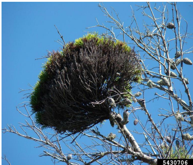
Witch's broom at Henderson Beach State Park, in Destin, Florida.