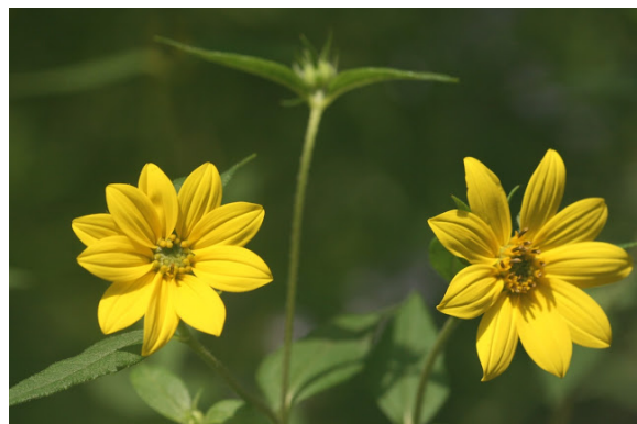
Small Woodland Sunflower: Helianthus microcephalus .