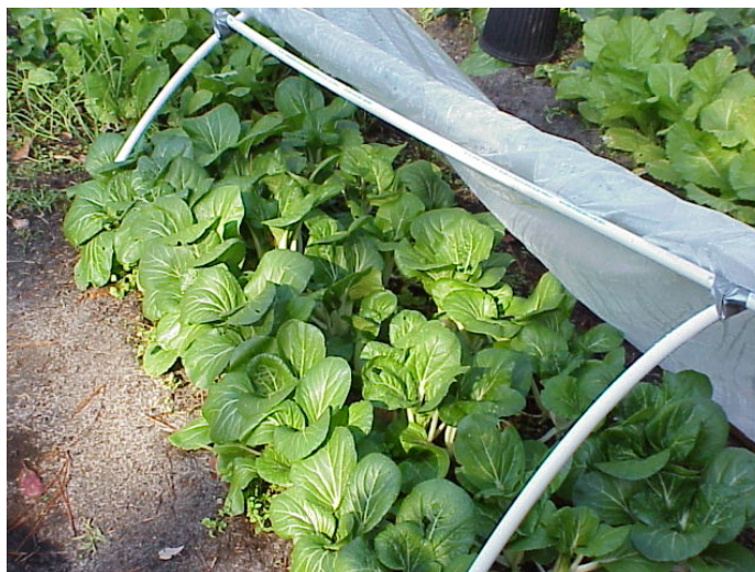
Lettuce row – photo courtesy of Gardening Solutions, IFAS

Bottom line: starting your own transplants from seed just gives you more options.