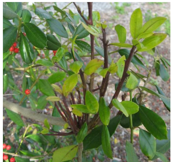
Witches' broom on holly infected by S. tumefaciens.

Transmission: Contaminated gardening tools as well as wind and rain. (Continued on next page)