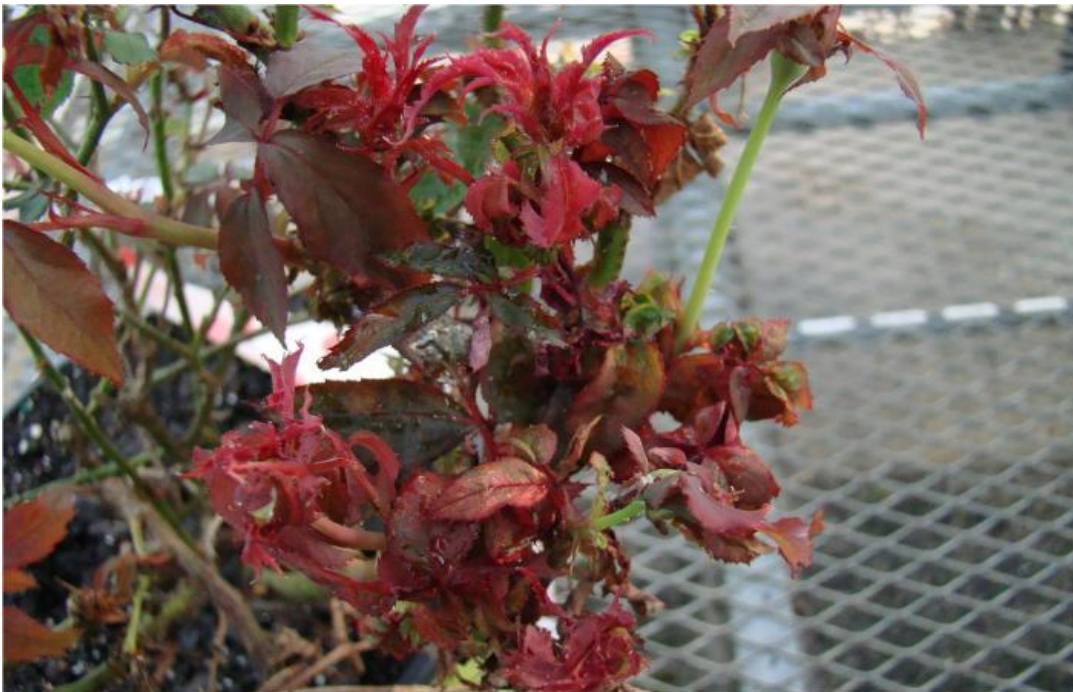
Witches' brooms on a rose plant infected with RRD.

The Rose Rosette virus infects both wild and cultivated roses. Originally discovered in Canada in 1940, it has spread throughout the United States and was discovered for the first time in Florida in 2013.