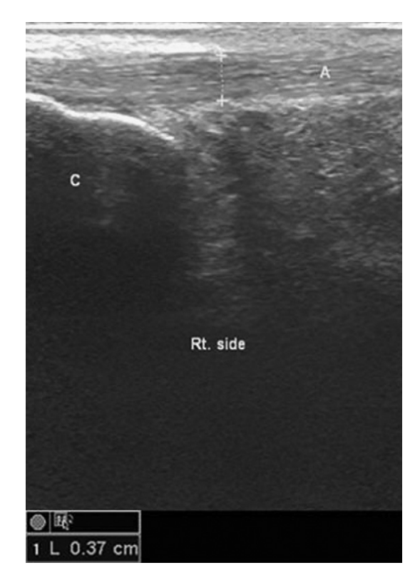
Fig. 3. Thickness of the right Achilles tendon pre-insertional area (0.37 cm) on ultrasonography of the patient at the final assessment; A, Achilles tendon; C, Calcaneus; Rt, Right; L, Level.

loading is considered to be one of the main pathological stimuli to the Achilles tendon (Paavola, Kannus, Järvinen, Khan, Józsa, & Järvinen, 2002). Badminton is a sport that requires jumps, lunges, quick hand motions, and changes in direction in a wide variety of postural positions (Shariff, George, & Ramlan, 2009). When landing after a jump while playing badminton, the body is upright while the ankle is maintained in a plantar-flexed position due to the activity of the gastrocnemius and soleus muscles (Schepsis et al., 2002). In the present case, the original injury was caused by the ankle being forced upwards while in a plantar-flexed position when landing after a jump during badminton, leading to a compression injury of the Achilles tendon. Furthermore, continuous treatment was not provided in the acute phase, and the patient continued to play badminton prior to complete recovery. Thus, the severe pain may have occurred gradually as repetitive microtrauma was imposed on the Achilles tendon. Based on the etiology, the Achilles tendinosis was caused by a combination of failure of the normal healing mechanisms and repeated trauma (Costa et al., 2006; Schepsis et al., 2002). In the more chronic phase of Achilles tendon disorders, the cardinal symptom is exercise-induced pain. In this case, a limited range of motion of approximately 5° in ADF and 25° in APF were