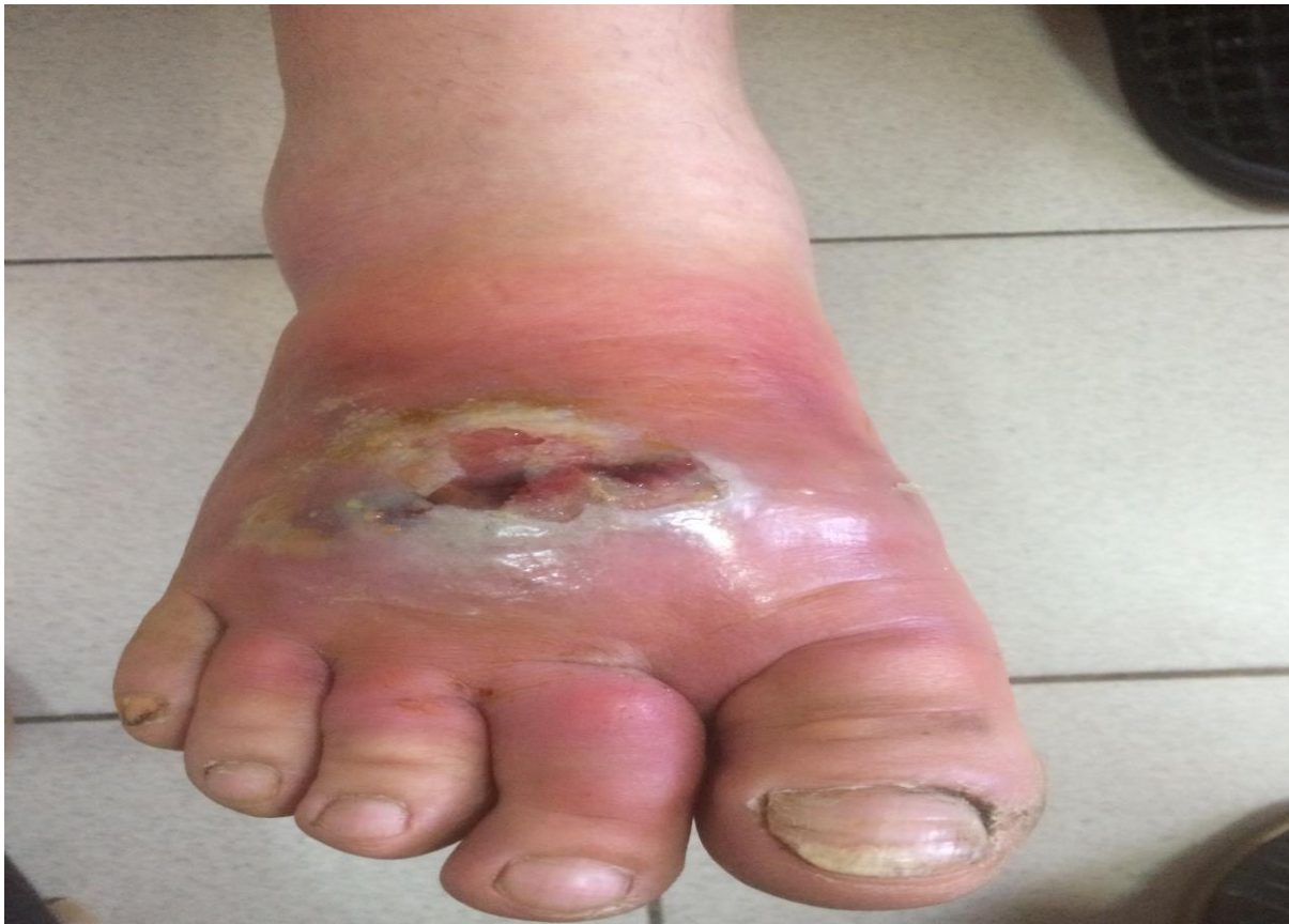
Fig.8. Forming phlegmon

Depending on the location distinguish subcutaneous, intermuscular, retroperitoneal abscesses and other types. By the nature of fluid distinguish purulent, hemorrhagic and purulent putrid form abscesses. Localization distinguish superficial and deep cellulitis. For an acute process, a quick onset is typical with temperature rise up to 39-40 ° C and higher, symptoms of general intoxication, thirst, severe weakness, chills and headache. With surface phlegmon, swelling and redness appear in the affected area. The affected limb increases in volume, is determined by an increase in regional lymph nodes.