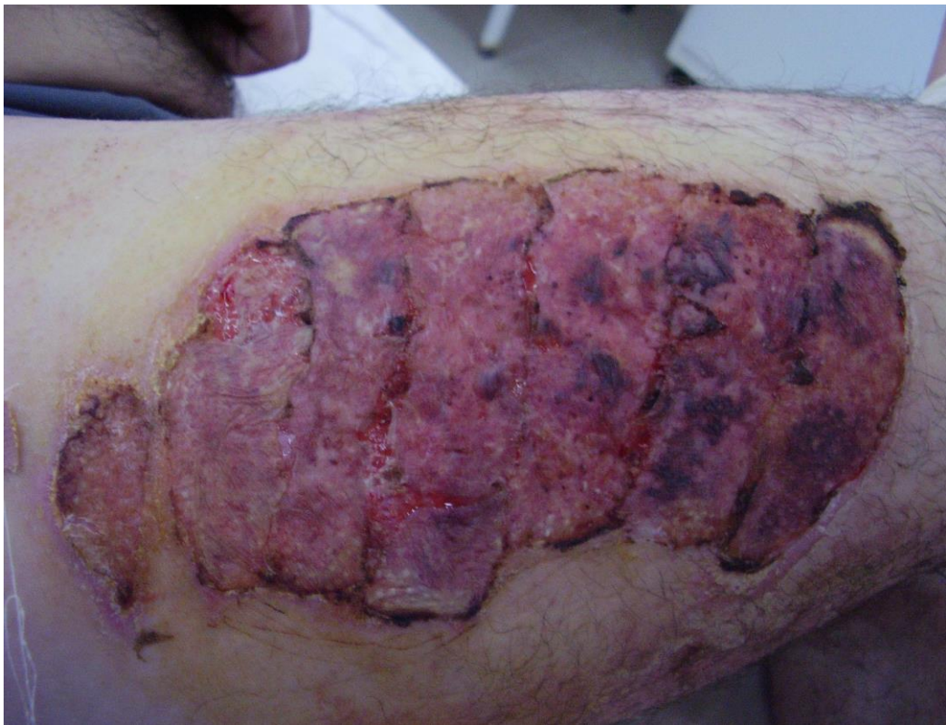
Fig.3. The regeneration