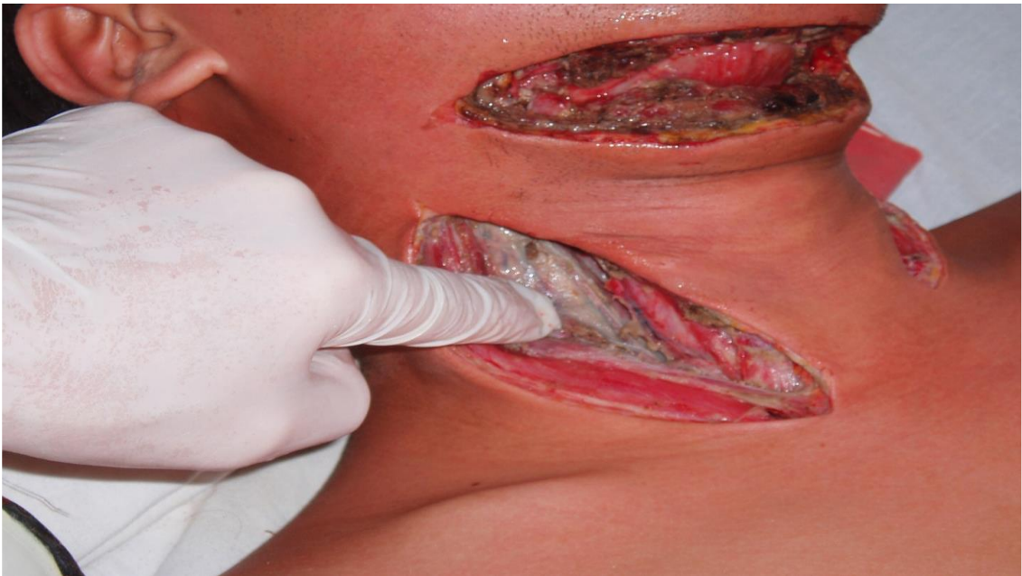
Fig.9. Excision the abscess in the operating room and under general anesthesia