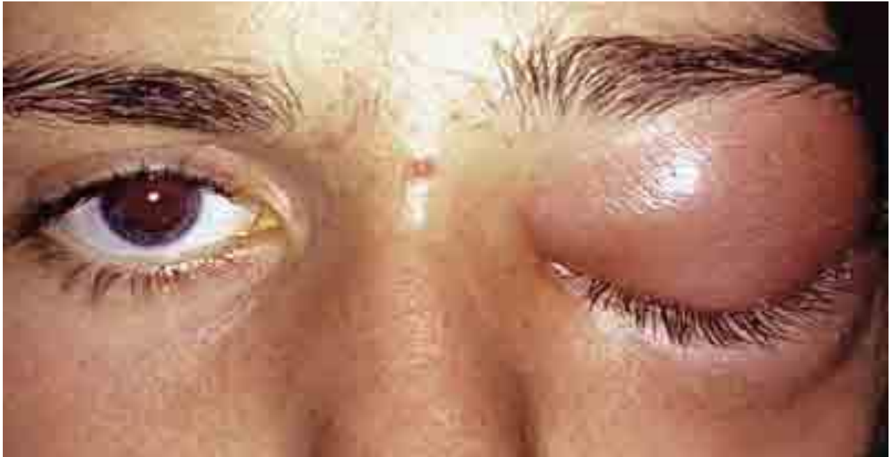
Fig.4. So, the main thing – oedema, rubor, color, dolor, functio lease

are general and local symptoms. Common symptoms - symptoms of purulent intoxication: fatigue, malaise, headache, insomnia, loss of appetite, fever. Local symptoms - it's a pain, swelling, redness, local temperature, rise dysfunction (Fig.4).