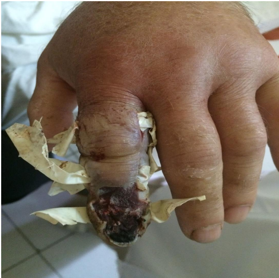
Fig.7. Bone whitlow