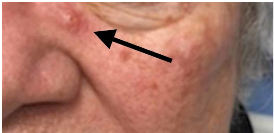
FIGURE 5: Lesion under left eye

The patient's complete blood count was negative for a leukocytosis or leukopenia, but was notable for the