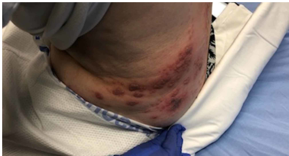
FIGURE 2: Lesions wrapping around to left flank and back