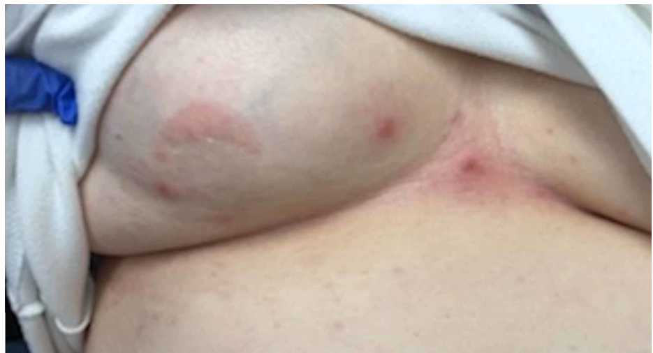
FIGURE 4: Lesions on anterior chest and left breast