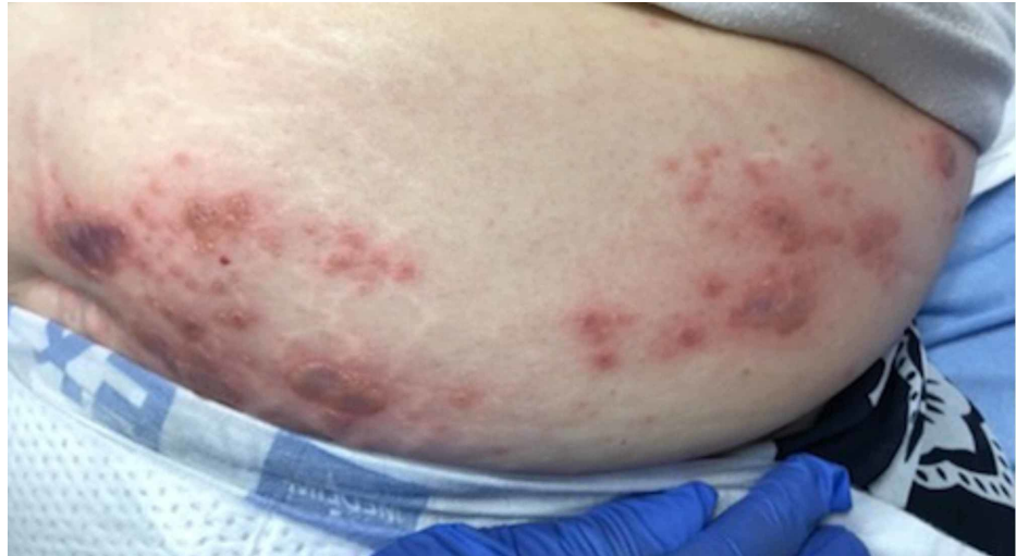
FIGURE 1: Lesions on left lower abdomen

light palpation with associated paresthesias. Fluorescein dye was applied to both eyes to examine for potential signs of herpes zoster ophthalmicus, and no such lesions were noted. The nose and both ears including the acoustic meatus were lesion free. Neurological examination was normal. On completion of the physical examination, at least four discrete dermatomes were found to be involved. The patient was placed under contact and airborne precautions.