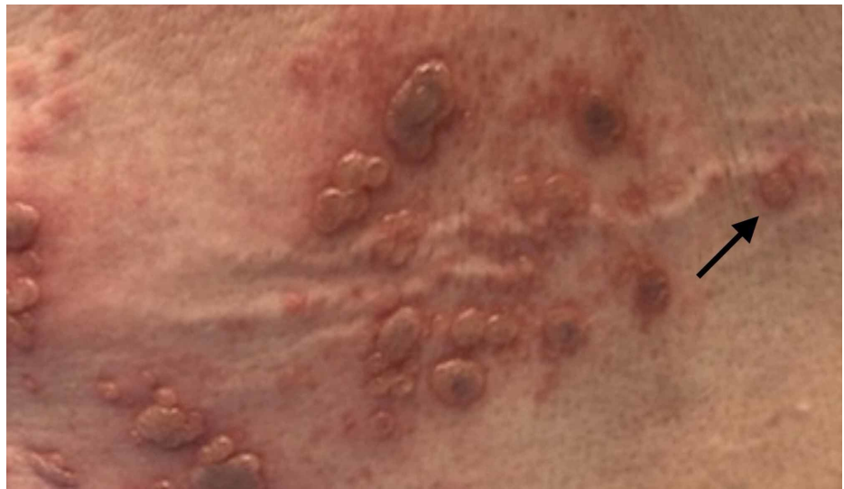
FIGURE 3: Lesions on left flank and back crossing midline