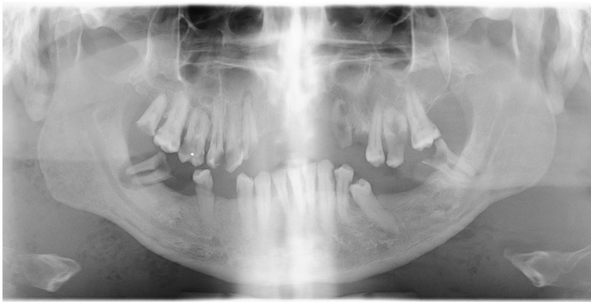
Figure 1. X-ray of the skull—panoramic radiograph. Numerous tooth roots are visible mainly in the mandible accompanied by periapical lesions